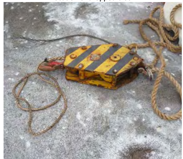
Crane block showing parted wire